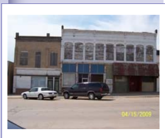
Structures on demolition list In Superior

providing the emergency assistance to state and local governments to purchase, redevelop, and rehabilitate foreclosed, abandoned, and vacant properties that otherwise are already or may become inhabitable. A main focus of the program is to return safe and decent affordable housing units to the market. The Neighborhood Stabilization Program 1 also allows for the demolition of blighted structures. The program is authorized under Title III of the Housing and Economic Recovery Act of 2008. DED administers the program.