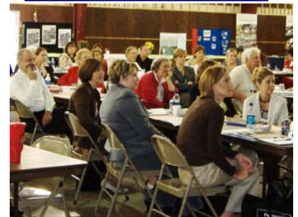
Rural Institute participants

"I gained so much perspective about the rural community and what needs to be done to attract businesses and people to be a part of rural Nebraska. I now have a large network of colleagues to go to for advice and suggestions about how to improve our community."