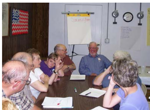
Participants were engaged in the Town Hall Meeting at Orleans

Community involvement provides residents the means to set the sail to direct the future of their community. Residents of the Village of Orleans are not only aware of this, they are taking action!