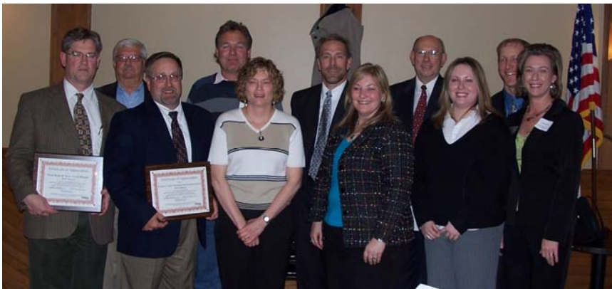
PK Edge Coalition Members