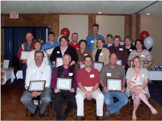
PK Edge Participants